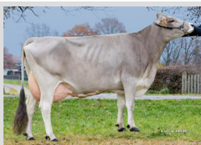
Brown Swiss: HACKER - Minka 4.Lak