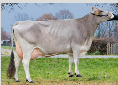
Brown Swiss: HACKER - Minka 4.Lak