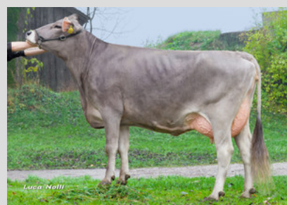
Brown Swiss: HACKER - Helena