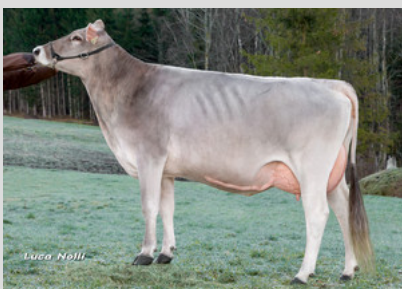
Brown Swiss: PUCK Selina