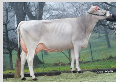
Brown Swiss: PUCK Zeder