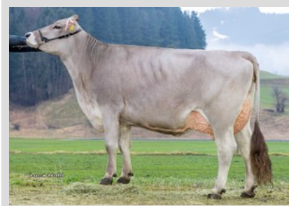
Brown Swiss VERDI Urml